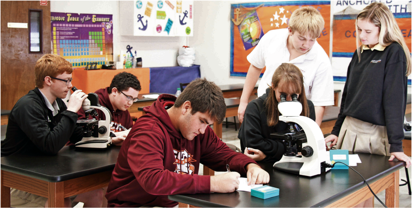
CHRIST'S CHURCH ACADEMY