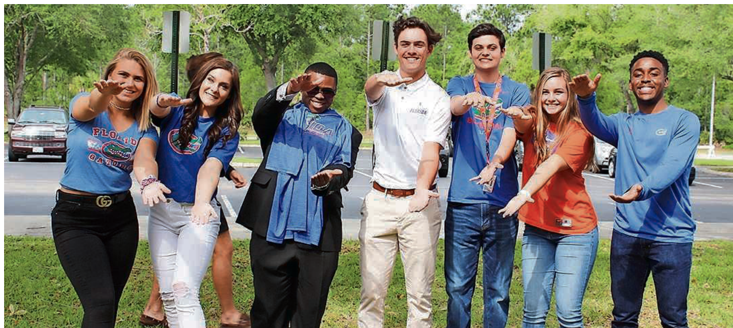
PROVIDENCE SCHOOL PHOTOS

A full range of extra-curricular programs is offered at Providence and it has one of the strongest athletic programs in North Florida. Over the past two decades, the athletic program has produced 18 professional and 217 collegiate athletes and has been recognized nationally on ESPN RISE, MaxPreps and USA Today. In 2019, Providence won both the FACA 2019 Athletic Program of the Year