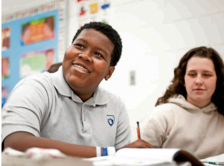
TRINITY CHRISTIAN ACADEMY