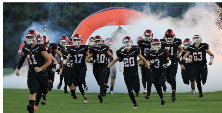
CHRIST'S CHURCH ACADEMY

Christ's Church Academy alumni have gone on to become engineers, nurses, doctors, missionaries, teachers and a va-