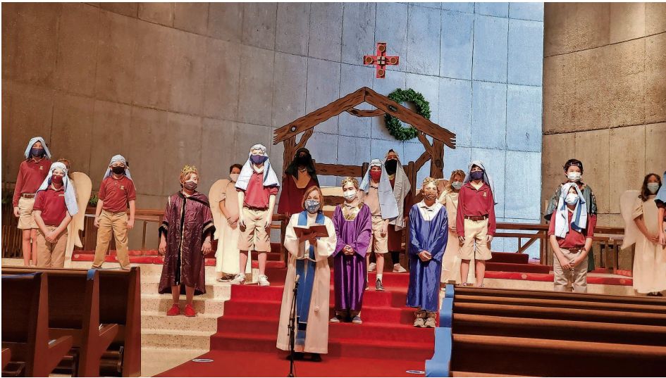
EPISCOPAL SCHOOL OF JACKSONVILLE