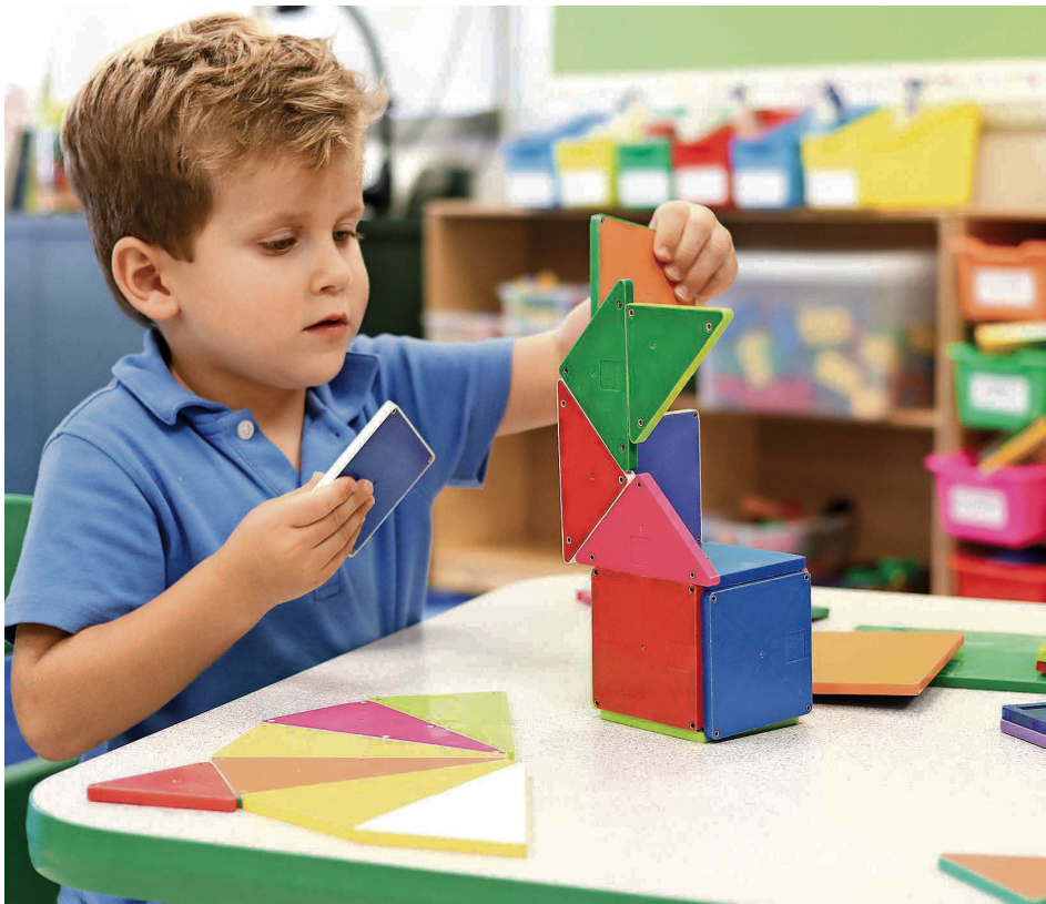
RIVERSIDE PRESBYTERIAN DAY SCHOOL