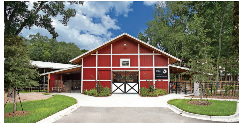
NORTH FLORIDA SCHOOL OF SPECIAL EDUCATION