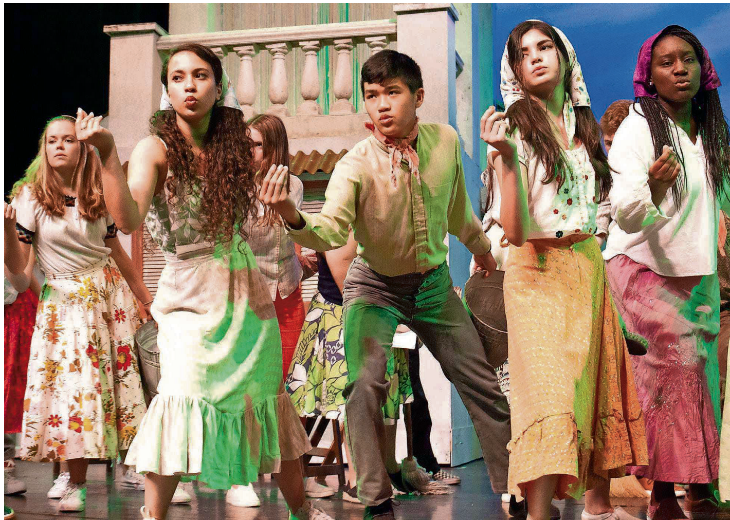
THE BOLLES SCHOOL

Bolles offers a comprehensive fine and performing arts program with courses in drama, dance, visual arts, chorus, music and band. Among middle and upper school students, 80 percent enrolled in arts classes this year, while 100 percent of lower school students are involved in art, music and theater in-