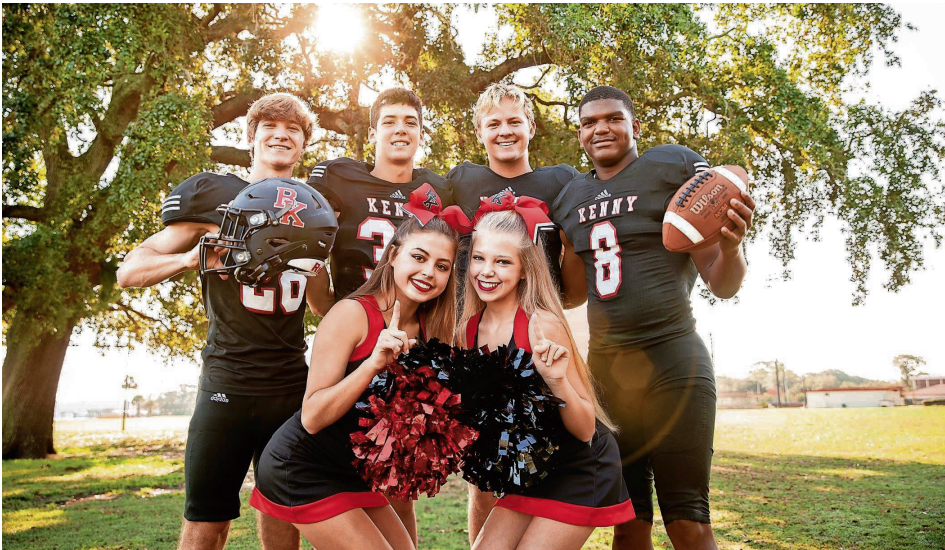
BISHOP KENNY HIGH SCHOOL