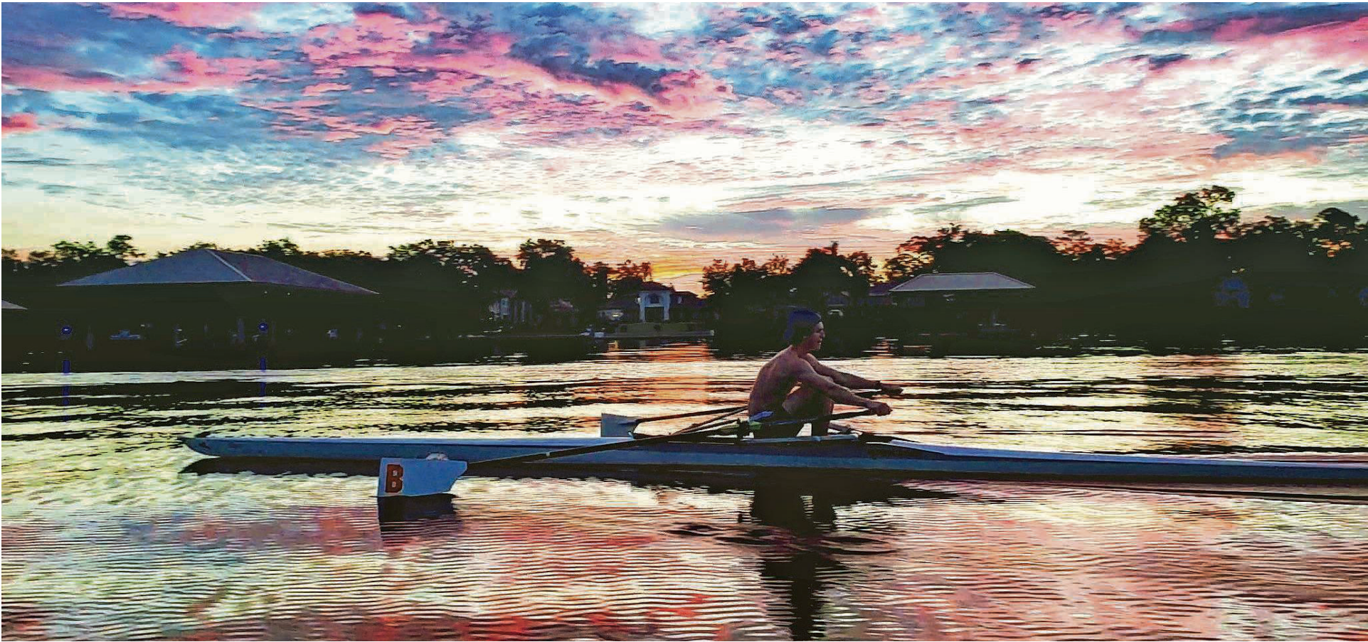
THE BOLLES SCHOOL

The 2021 Guide to Private Schools aims to shine a spotlight on some of the private and independent schools available on the First Coast. These institutions provide a variety of options for parents seeking an educational environment in which their child can truly thrive. According to the Florida Department of Education’s Annual Report for 2019-2020, of the 3,274,012 statewide total PK-12 student enrollment in the 2019-20 school year, 397,970 (12.2%) were pri-