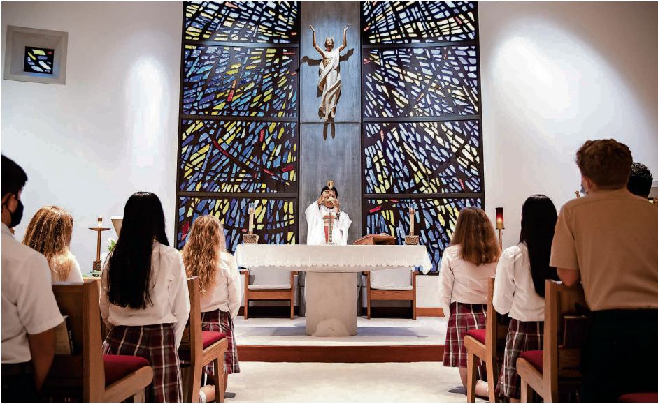
BEEHIVE FOUNDRY/BISHOP KENNY HIGH SCHOOL