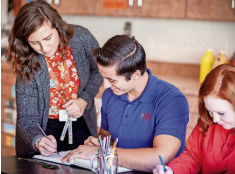
BISHOP SNYDER HIGH SCHOOL