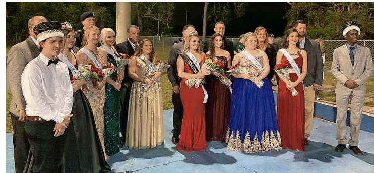
EAGLE'S VIEW ACADEMY

Electives allow students to explore psychology, martial arts, home econom-