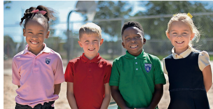
TRINITY CHRISTIAN ACADEMY

Through comprehensive education and enriching programs, we help students discover their passions outside of the classroom. Our athletic programs are among the finest in the State of Florida, offering 12 sports for both male and female athletes. Our award-winning music program offers music lessons and performance opportunities in our renowned band and choir.