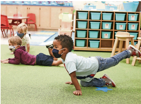
RIVERSIDE PRESBYTERIAN DAY SCHOOL