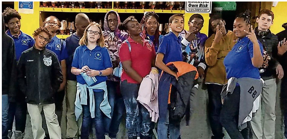
HEART TO HEART ACADEMY